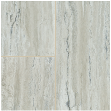
Roman Travertine 12" x 24" 208DH461 Recommended Grout: E5 Gypsum