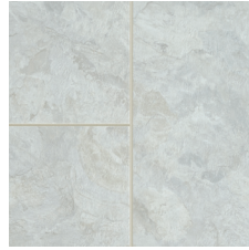
Misty Slate 12" x 24" 207DH461 Recommended Grout: J10 Mist