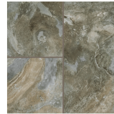
Stormy View 12" x 24" 212DH461 Recommended Grout: D4 Mushroom