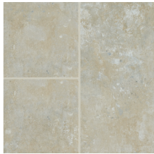
Sandy Coast 12" x 24" 211DH461 Recommended Grout: J10 Mist