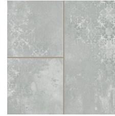
Venice Tower 12" x 24" 206DH461 Recommended Grout: B2 Smoke