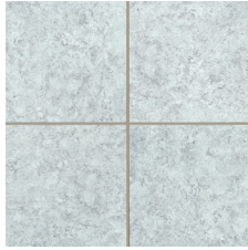
Stone Tower 16" x 16" 202DH161 Recommended Grout: B2 Smoke