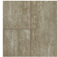
Cast Brownwood 12" x 24" 210DH461 Recommended Grout: G7 Cocoa