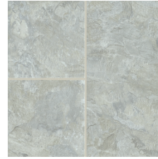
Dawn Slate 12" x 24" 204DH461 Recommended Grout: J10 Mist