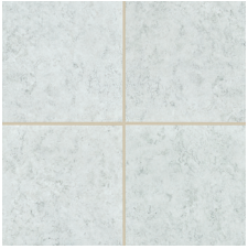
Stone Cottage 16" x 16" 201DH161 Recommended Grout: E5 Gypsum