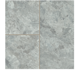
Stormy Slate 12" x 24" 205DH461 Recommended Grout: B2 Smoke