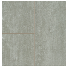
Cast Graywood 12" x 24" 209DH461 Recommended Grout: B2 Smoke