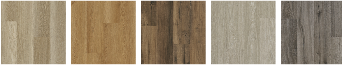
Naturally Tan EKPT60L01E