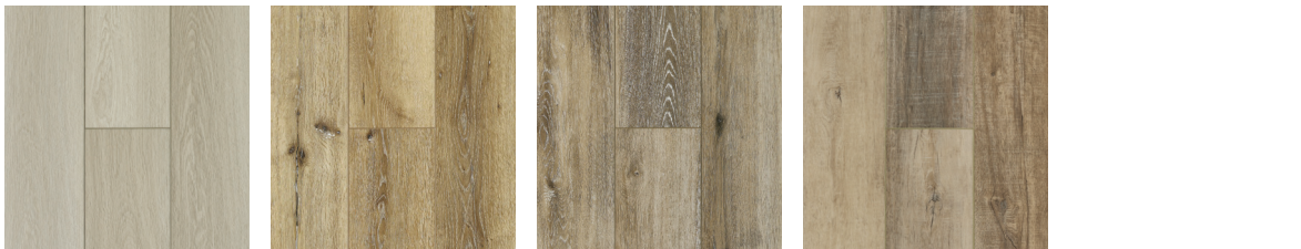
Barely There EKPT70L20E