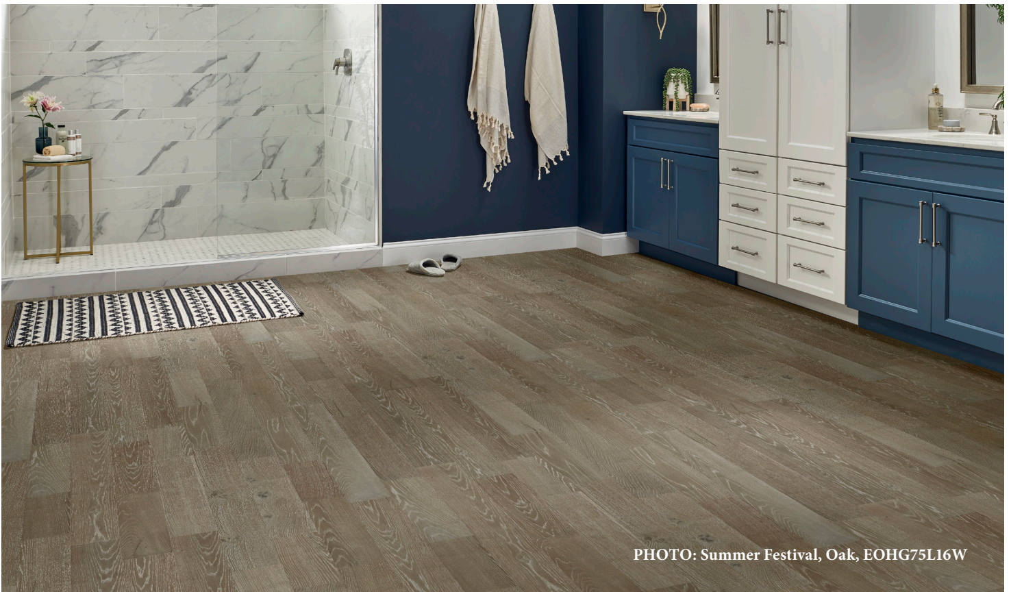
PHOTO: Summer Festival, Oak, EOHG75L16W