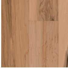
Maple - Natural 6-1/2" EMHG75L03S