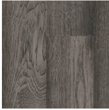
Hickory - Twilight 6-1/2" EHHG75L17W