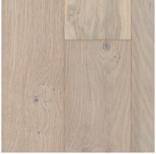
Oak - Heavenly 6-1/2" EKHG75L01S