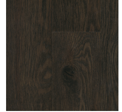
Hickory - Forest Beyond 6-1/2" EHHG75L12W