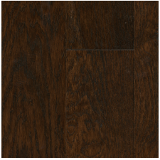
Oak - Shaded Terrace 6-1/2" EKHG75L09H