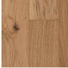
Oak - Natural 6-1/2" EKHG75L03H