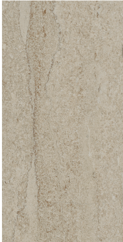
PD12404 ▶ Overlook