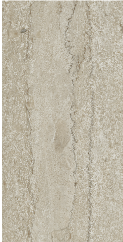
PD12401 ▶ Rift