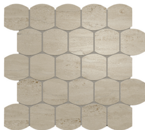
11 x 11 Barrel Mosaics Mounted on a 268 x 270 sheet (available in all colors)