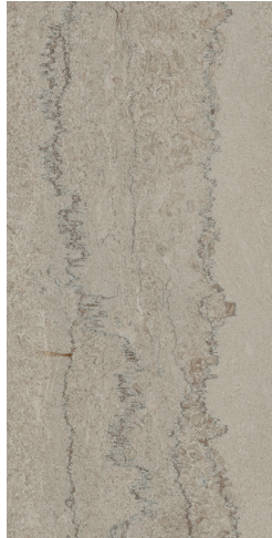
PD12407 ▶ Reflection