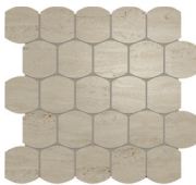
11 x 11 Barrel Mosaics Mounted on a 268 x 270 sheet