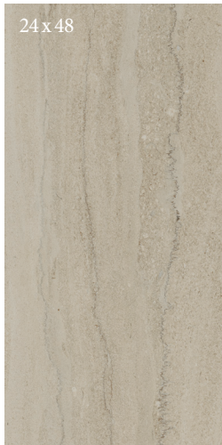
24 x 48