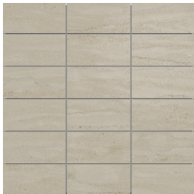
2 x 4 Stacked Mosaics Mounted on a 296.9 x 296.9 sheet (available in all colors)