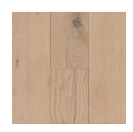
Serene Moment 7-1/2" AWEK254W