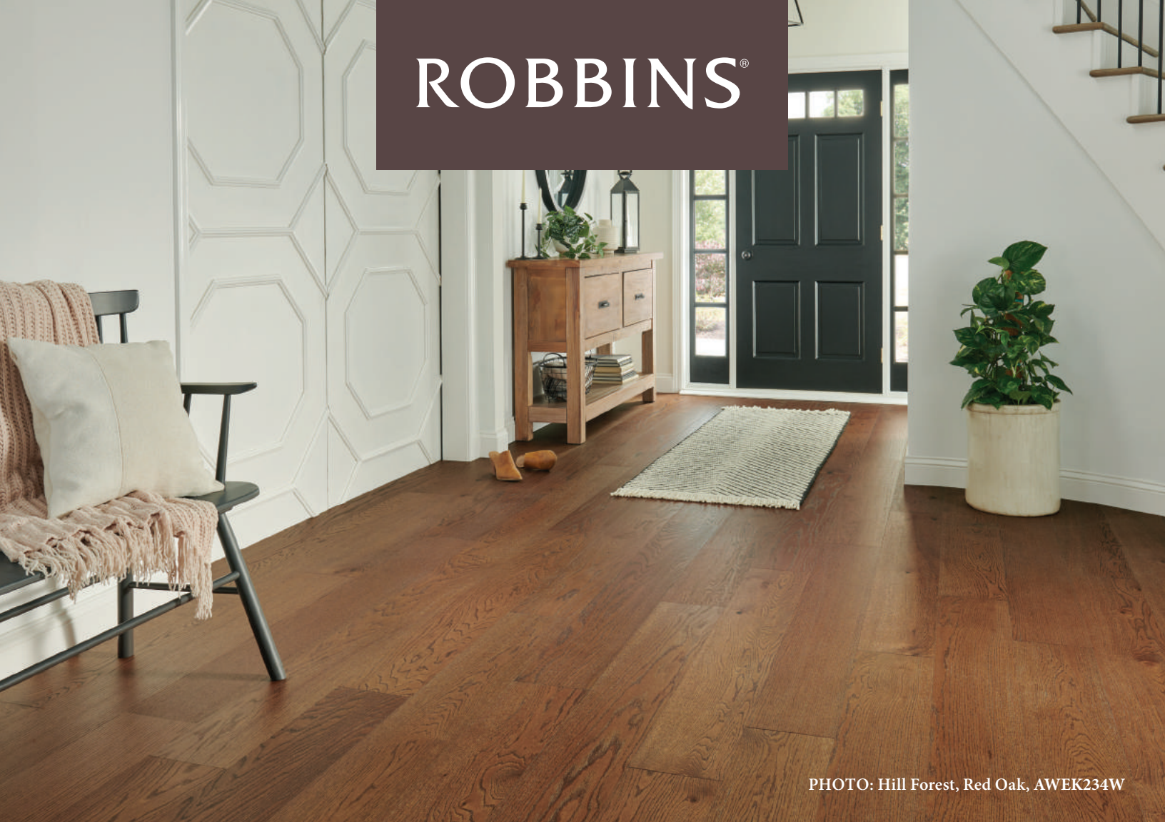
PHOTO: Hill Forest, Red Oak, AWEK234W